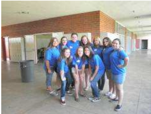
SSB at the summer leadership conference.

Below are the bios and headshots so that you can get to know your SSB.