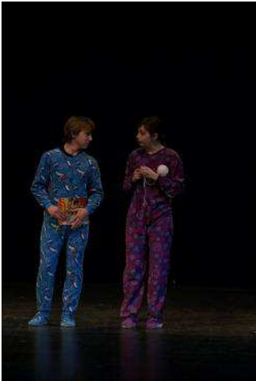
The 1st place winners from Notre Dame