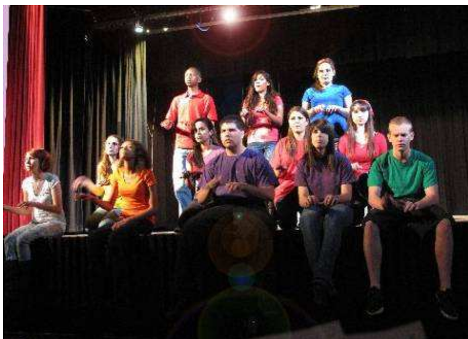
Runners-Up from Rancho Cucamonga