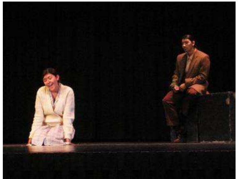
Alhambra High Actors